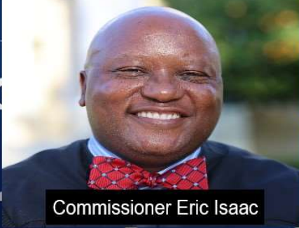
Commissioner Eric Isaac