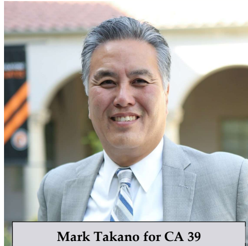
Mark Takano for CA 39